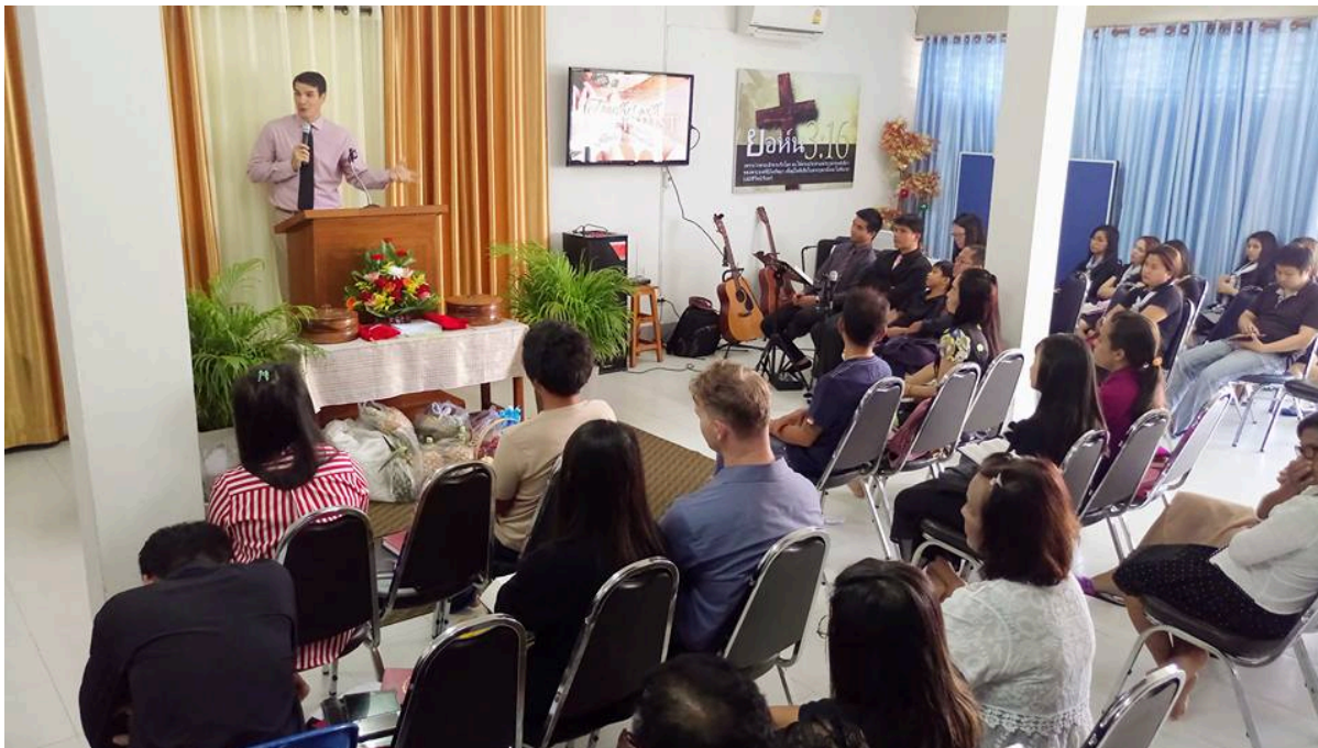
Preaching at the Bible Believing Baptist Church in Chiang Rai, Thailand.

support and prayer for us. Every breakthrough we ever experience happens because of the power of your prayer.